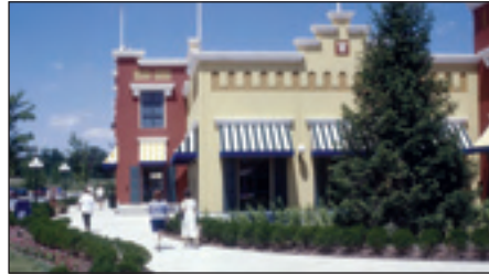
The Prime Outlets in Hagerstown

20220 Jefferson Blvd., Hagerstown, MD 21742 Driving Range, 18 Hole Par 3, Miniature Golf, and batting cages. Open: 7 days 8 - 7