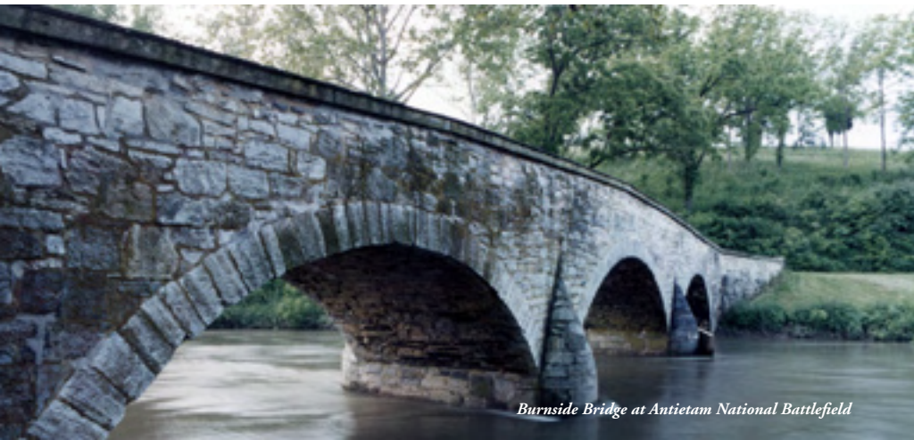
Burnside Bridge at Antietam National Battlefield